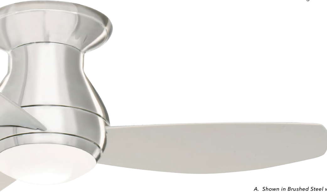
A. Shown in Brushed Steel with Brushed Steel Blades and Opal Matte Glass Shade