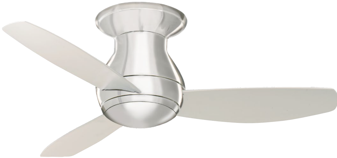
A. Shown in Brushed Steel with Brushed Steel Blades and No-Light Option

A. 44" CURVA™ SKY LED INDOOR – BRUSHED STEEL CF145LBS - Brushed Steel Blades, Opal Matte Glass Shade