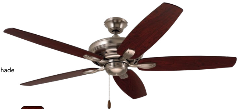
D. ASHLAND - BRUSHED STEEL CF717BS - Walnut/Dark Cherry Blades, Opal Matte Glass Shade