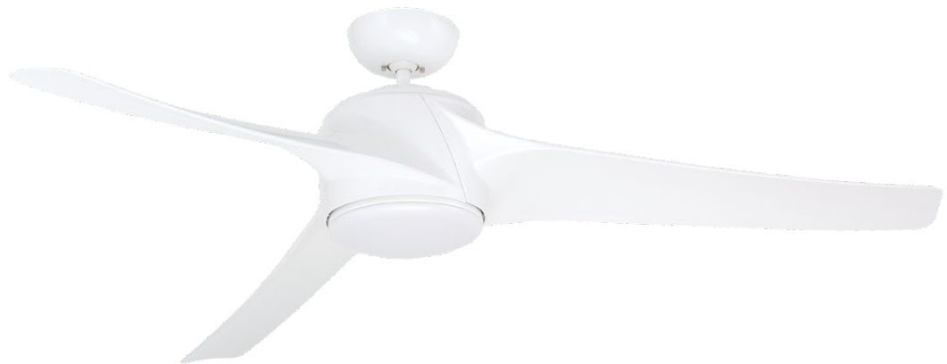
C. Shown in Appliance White with Weather-Resistant Appliance White Blades and Opal Matte Shade