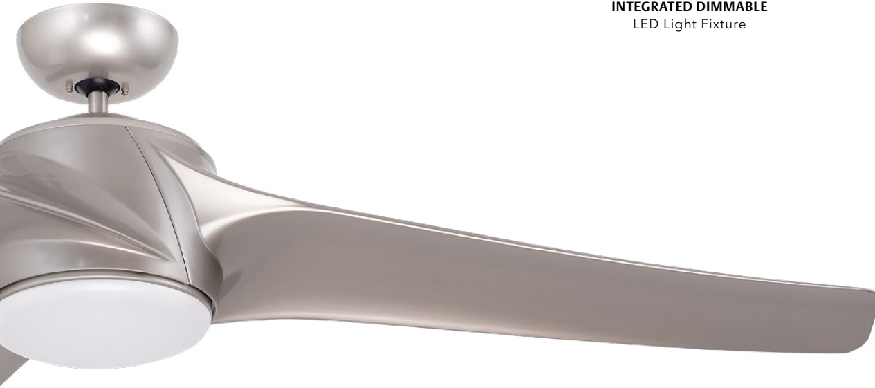
A. Shown in Platinum with Weather-Resistant Platinum Blades and Opal Matte Shade