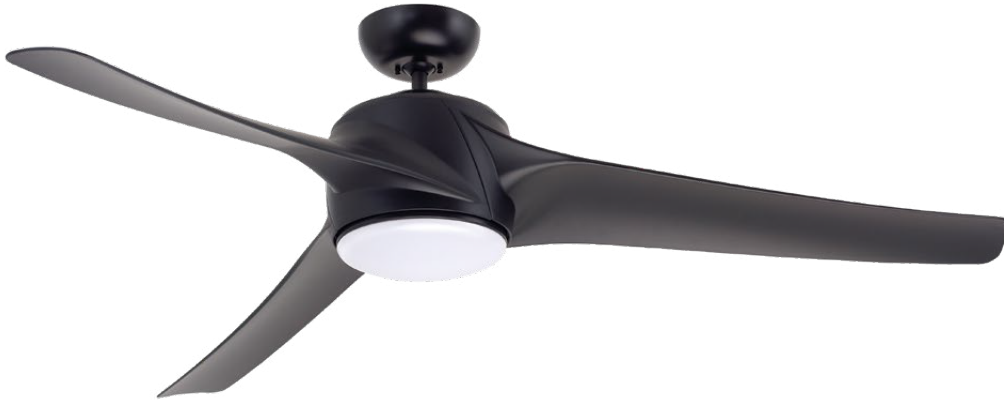
B. Shown in Barbeque Black with Weather-Resistant Barbeque Black Blades and Opal Matte Shade