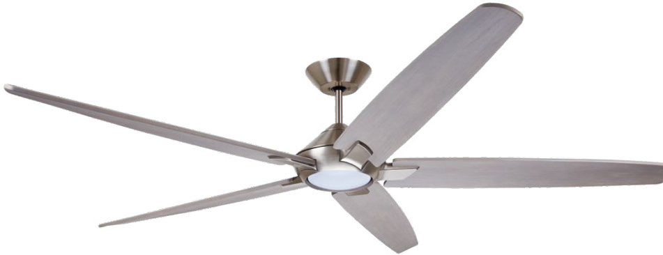
G. Shown in Brushed Steel with Curved Solid Wood Timber Gray Blades and Opal Matte Shade