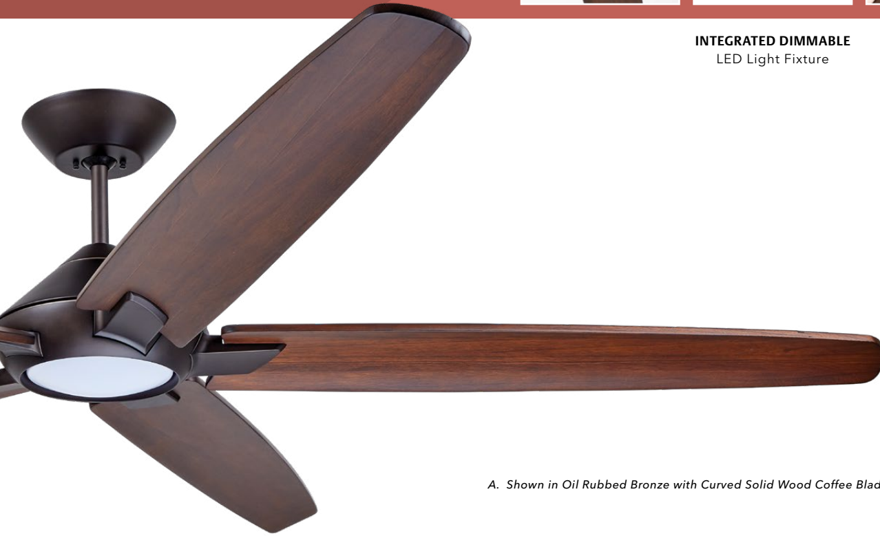
A. Shown in Oil Rubbed Bronze with Curved Solid Wood Coffee Blades and Opal Matte Shade