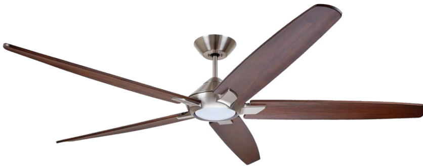
F. Shown in Brushed Steel with Curved Solid Wood Coffee Blades and Opal Matte Shade