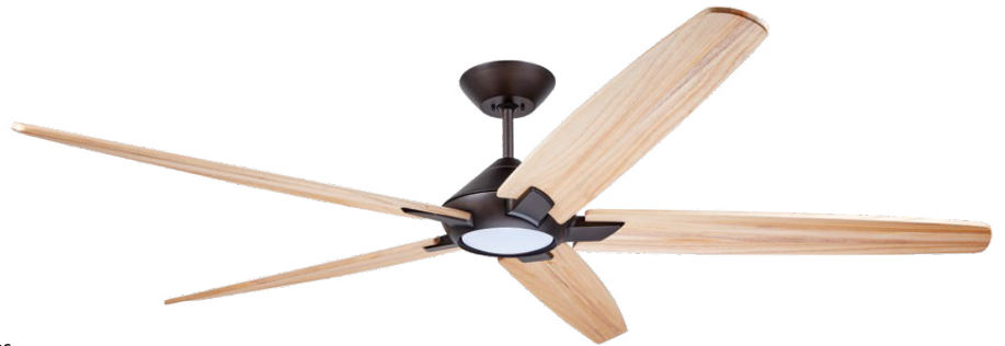
H. Shown in Oil Rubbed Bronze with Curved Solid Wood Natural Blades and Opal Matte Shade

SHIPPING SPECIFICATIONS: Carton Weight: 21.20 LBS | Length: 32.50" | Width: 18.50" | Depth: 10.25"