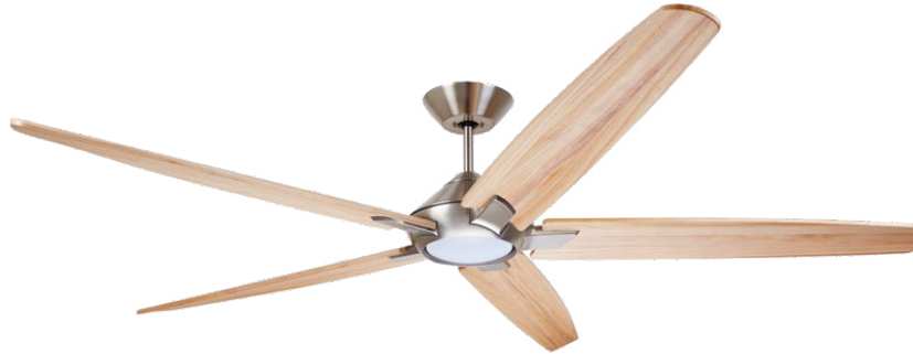
C. Shown in Brushed Steel with Curved Solid Wood Natural Blades and Opal Matte Shade