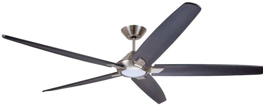
B. Shown in Brushed Steel with Curved Solid Wood Charcoal Blades and Opal Matte Shade