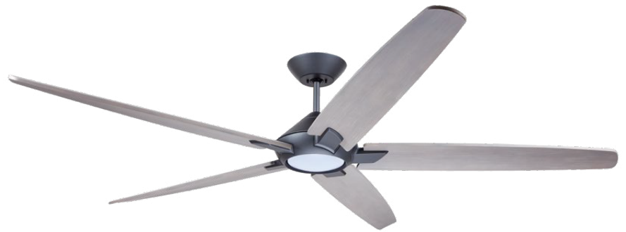
D. Shown in Graphite with Curved Solid Wood Timber Gray Blades and Opal Matte Shade