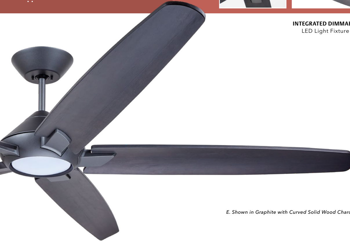
E. Shown in Graphite with Curved Solid Wood Charcoal Blades and Opal Matte Shade