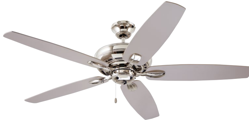
G. Shown in Polished Nickel with Light Gray Blades