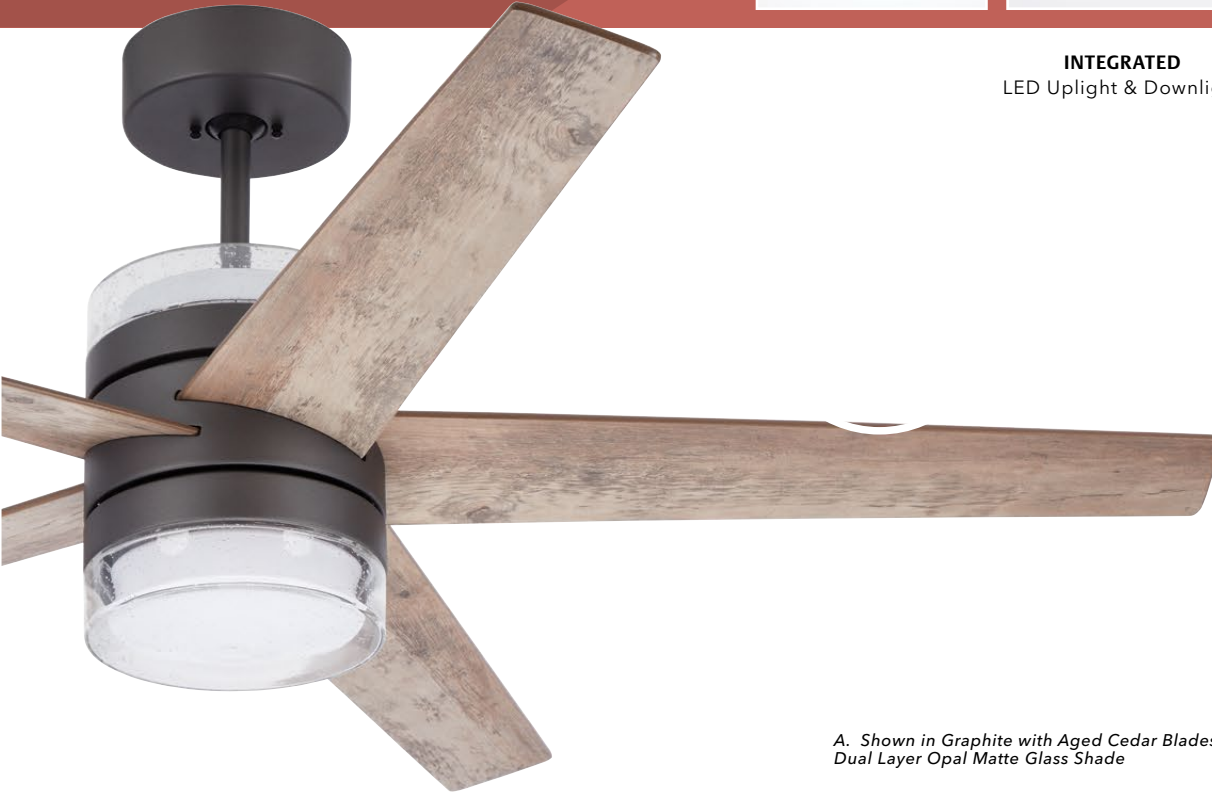
A. Shown in Graphite with Aged Cedar Blades and Dual Layer Opal Matte Glass Shade