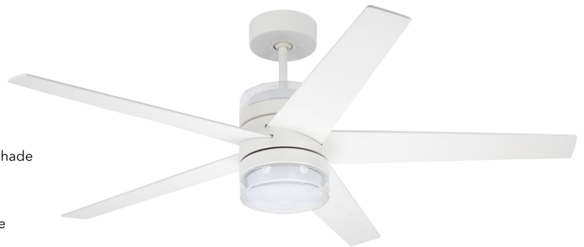
D. Shown in Satin White with Satin White Blades and Dual Layer Opal Matte Glass Shade