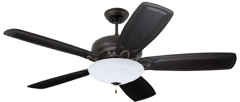
D. Shown in Golden Espresso with 25" Carved Hardwood Classic Vintage Black Blades (B90VBL) and Riley Light Fixture (LK180)