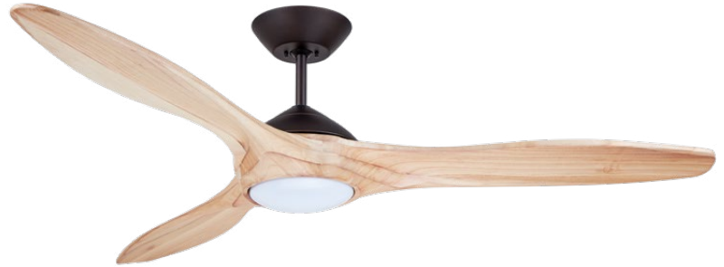
D. Shown in Oil Rubbed Bronze with Sculpted Solid Wood Natural Blades and Opal Matte Shade