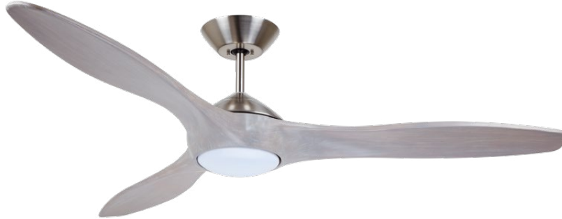
C. Shown in Brushed Steel with Sculpted Solid Wood Timber Gray Blades and Opal Matte Shade