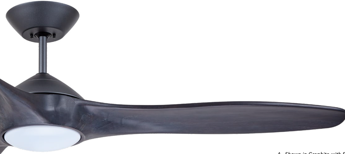
A. Shown in Graphite with Sculpted Solid Wood Charcoal Blades and Opal Matte Shade