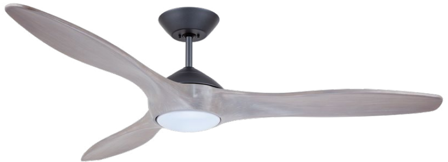
H. Shown in Graphite with Sculpted Solid Wood Timber Gray Blades and Opal Matte Shade

H. 60" LINDBERGH ECO – GRAPHITE CF315TM60GRT - Sculpted Solid Wood Timber Gray Blades, Opal Matte Shade