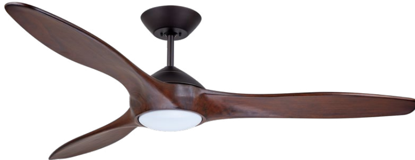
G. Shown in Oil Rubbed Bronze with Sculpted Solid Wood Coffee Blades and Opal Matte Shade

E. 60" LINDBERGH ECO – BRUSHED STEEL CF315NA60BS - Sculpted Solid Wood Natural Blades, Opal Matte Shade