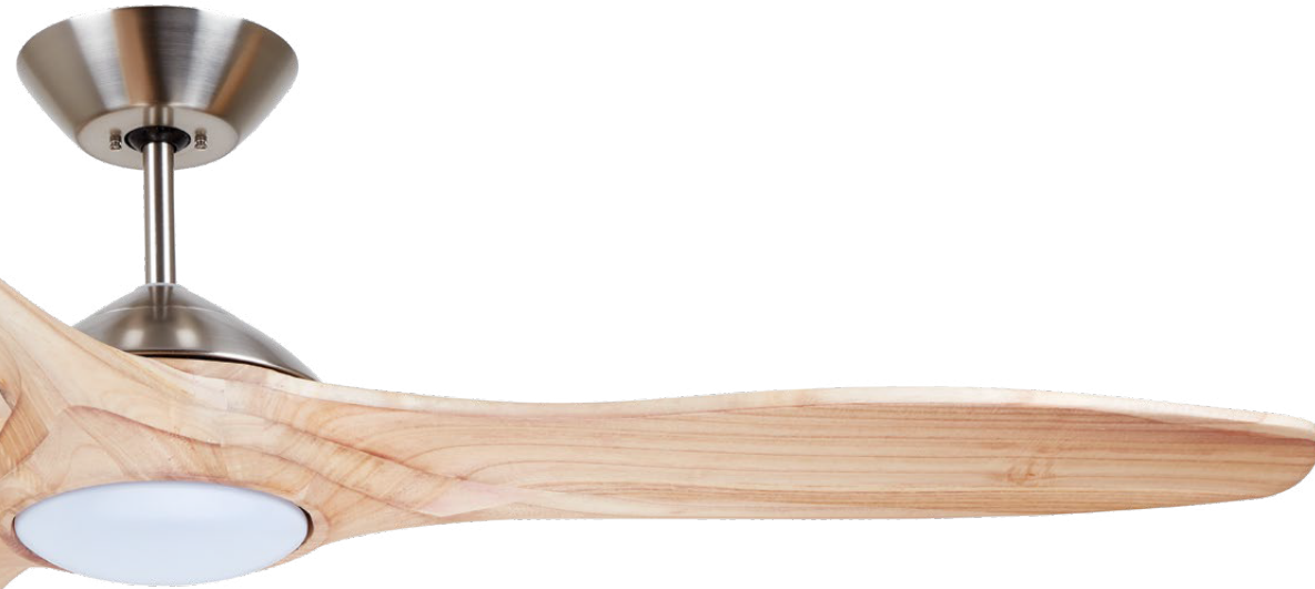
E. Shown in Brushed Steel with Sculpted Solid Wood Natural Blades and Opal Matte Shade