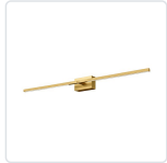
WS25336-BG-UNV Brushed Gold