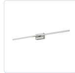
WS25336-BN-UNV Brushed Nickel